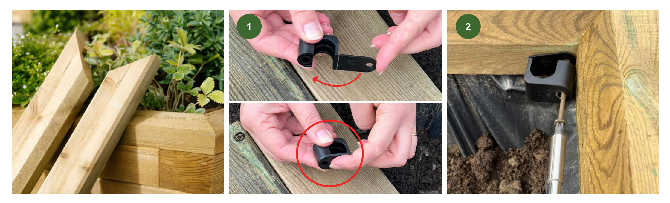
Traditional & Modern capping styles - follow the same crop protector attachment method